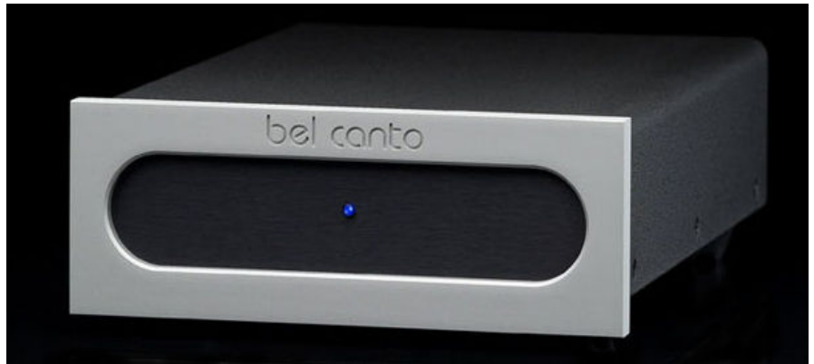
The REF500s unparalleled power in a stereo chassis

The REF500s provides high power in a compact stereo chassis. It delivers 121dB dynamic range and 200 watts into 8 ohms, doubling to 400 watts into 4 ohms. The combination of fully-regulated switch-mode power supplies and analog control circuitry brings great dynamic expression to your music.